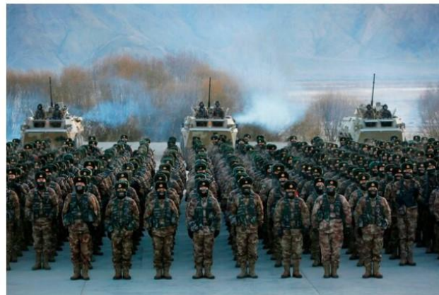
Chinese soldiers during a training exercise in Xinjiang in January.

The warning from the 30-country alliance , that China increasingly poses a global security problem, signaled a fundamental shift in the attention of an institution devoted to protecting Europe and North America.